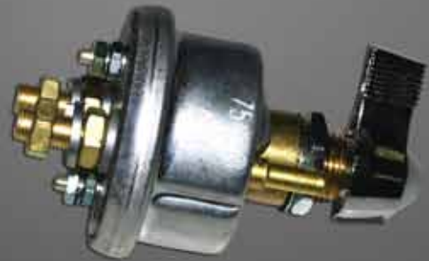
Part No. 1700

A weather resistant dual pole master disconnect switch (battery isolator). This switch is constructed from plated steel and has an indexing pin to align the unit and prevent rotation. The operating shaft is o-ring sealed and the terminal insulator is sealed with a gasket.