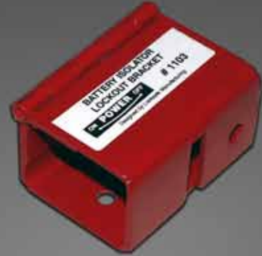
Part No. 1103

The isolator lockout bracket is designed to create a safer working environment for maintenance staff and increases security for mobile equipment. This bracket suits the common Cole Hersee/Britax style battery isolators and provides a positive lockout in the off position. This ensures the safety of staff working on or around the machine and decreases the likelihood of theft.