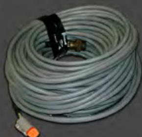
Part No. 5657 Loom 25m to suit 1251 reset unit