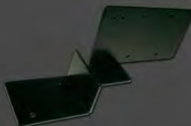
Part No. 8017 Bracket to suit reset unit