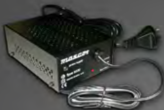
Part No. 9414 Power supply