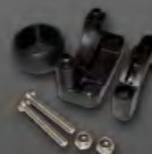
Part No. 9265 Mount to suit barrier eye 9244