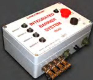
Part No. 5642 Transmitter umbilical 12 volt 4 beam

Below are the common parts used in a typical barrier system set up. For individual specifications on each part, or professional advice on selecting the right components for your application, please contact RCT.