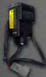
Part No. 9244 Barrier eye module to suit barrier system