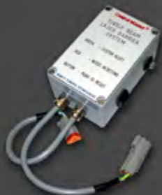
Part No. 8043 Reset unit to suit 7579