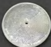
Part No. 9239 Reflector round 75mm