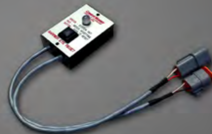
Part No. 1251 Barrier eye reset multi voltage