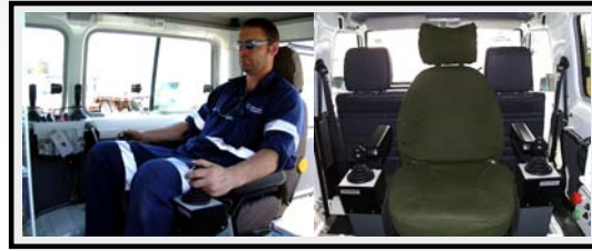
Telermote personnel carrier