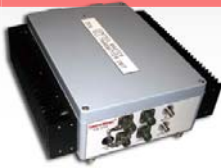
Part No. 3249 Telermote transmitter