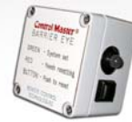
Part No. 2604 Reset unit