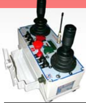
Part No. 3561 CM2000D transmitter