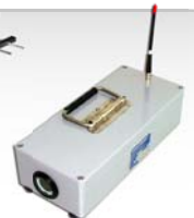
Part No. 3934 Telermote test unit