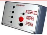
Part No. 7278 4 beam barrier transmitter