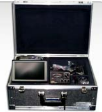
Part No. 3145 Telermote test kit