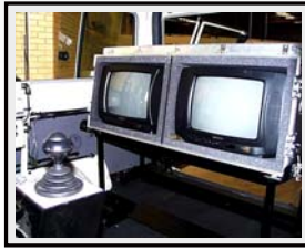
Modular Telermote assembly