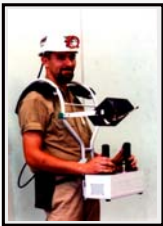
Portable recovery Telermotes