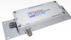
Part No. 7203 Diplexing filtering combiner