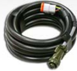
Part No. 7284 Camera loom