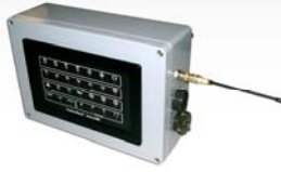
Part No. 7847 CM2000D receiver