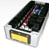
Customised Part Machine electrical interfaces