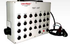
Part No. 0053 CM2000D TX/RX test unit