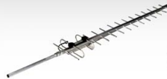
Part No. 4150 Dual frequency antenna