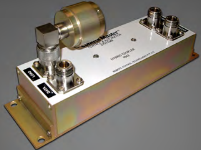
Part No. 0942

The unit has three "N" type connectors and must be installed in the correct configuration.