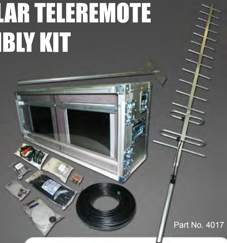
Part No. 4017

The MTA kit includes two 15" LCD monitors enclosed in a robust transit case. The MTA kit can be used as a stand alone unit or built into any type of Teleremote station application.