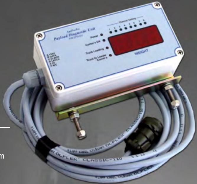
Part No. 8481