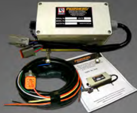
Part No. 5889 Electronic speed limiter Toyota LC70

This software enables the user to set a machine's maximum speed to suit the application and the operating conditions. The system eliminates the need to lockout gears to try and reduce the overall speed of the vehicle.