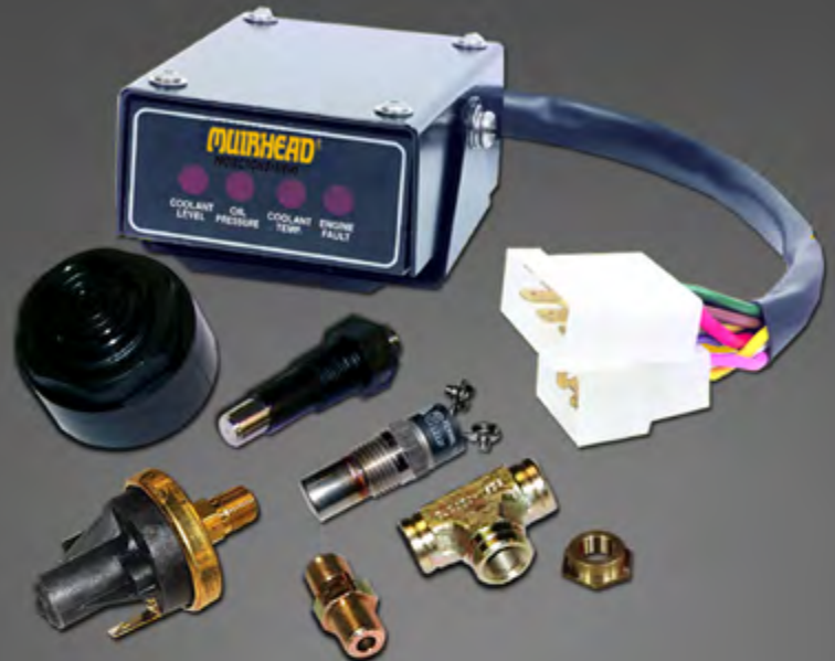
Part No. 9303

Compact in design and easy to install, the forklift engine protection system is an effective tool in the management of engine protection and engine maintenance for forklift machines.