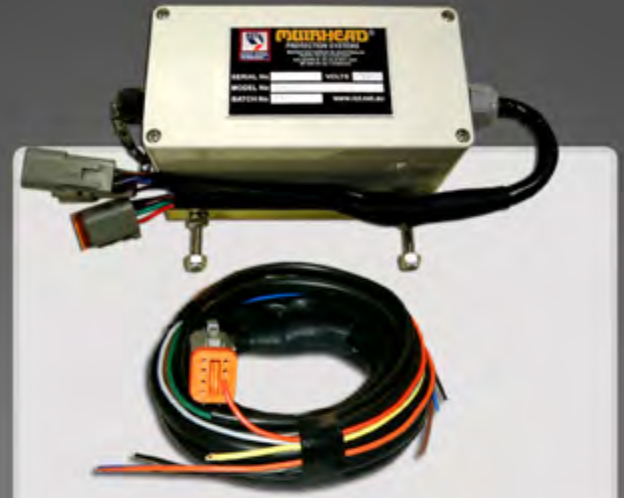
Part No. 3018 Dual throttle speed limiter module Part No. 5889 Speed limiter kit T/S Toyota landcruiser V8

Each speed limiter kit is custom built to suit the light vehicle application. Standard kits are available to suit: