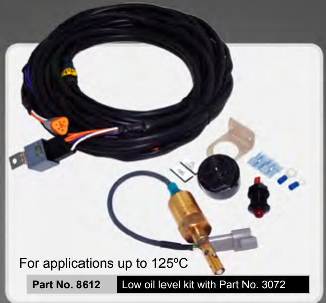
For applications up to 125°C

Mobile machines, commercial vehicles, boats, generators, pumps and compressors, etc