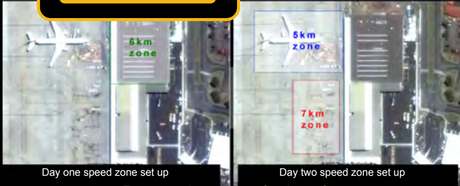
Day one speed zone set up