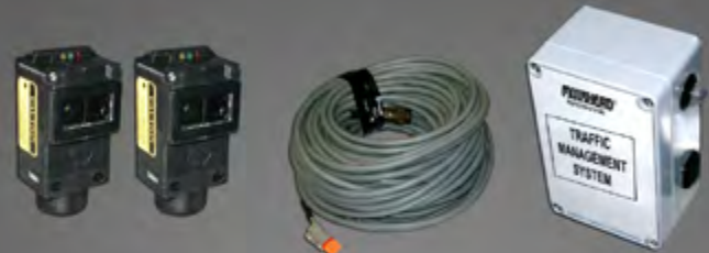
Part No. 3337 Traffic management system