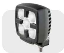
Nordic LED N25 lights