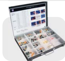
Deutsch DTM service kit