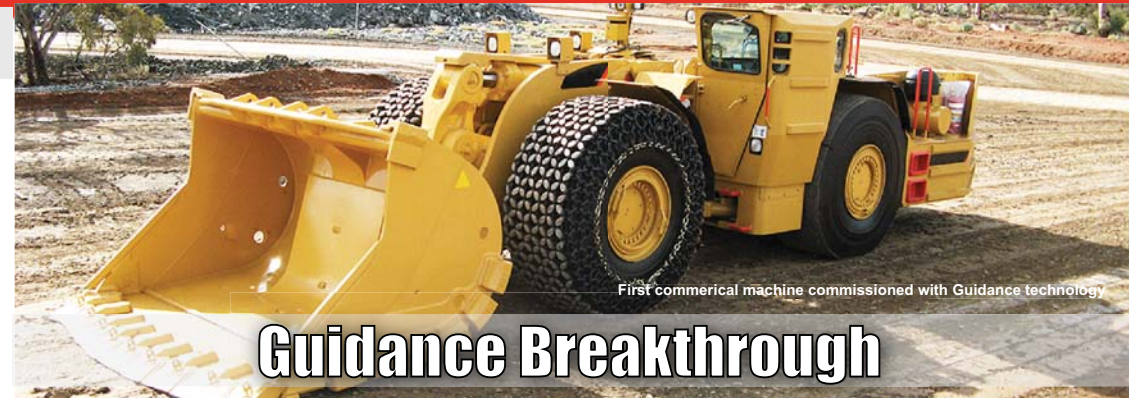
First commercial machine commissioned with Guidance technology

It gives the operators a safe and comfortable work environment, and as much machine feedback as required.