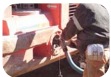
Fuel cap isolation system