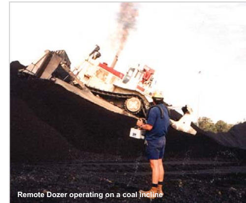
Remote Dozer operating on a coal incline

The main catalyst for the project was the need to remove the operator from the machine work environment, which is the stockpile.