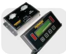
New AMS series 2